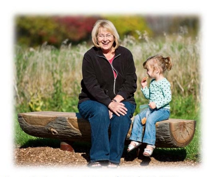
Greenville Recreation & Parks / 252 / 329-4567