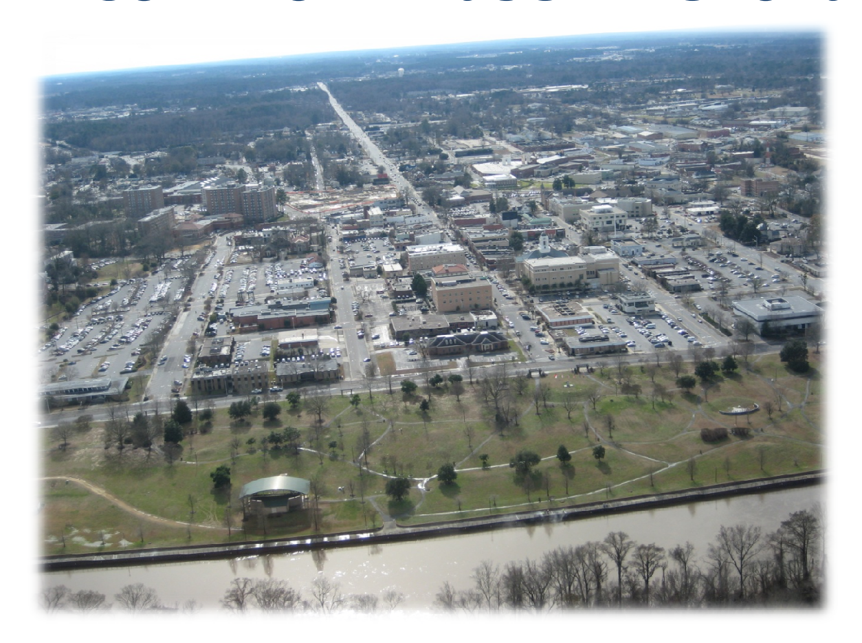
RFQ – Pre-submittal Conference