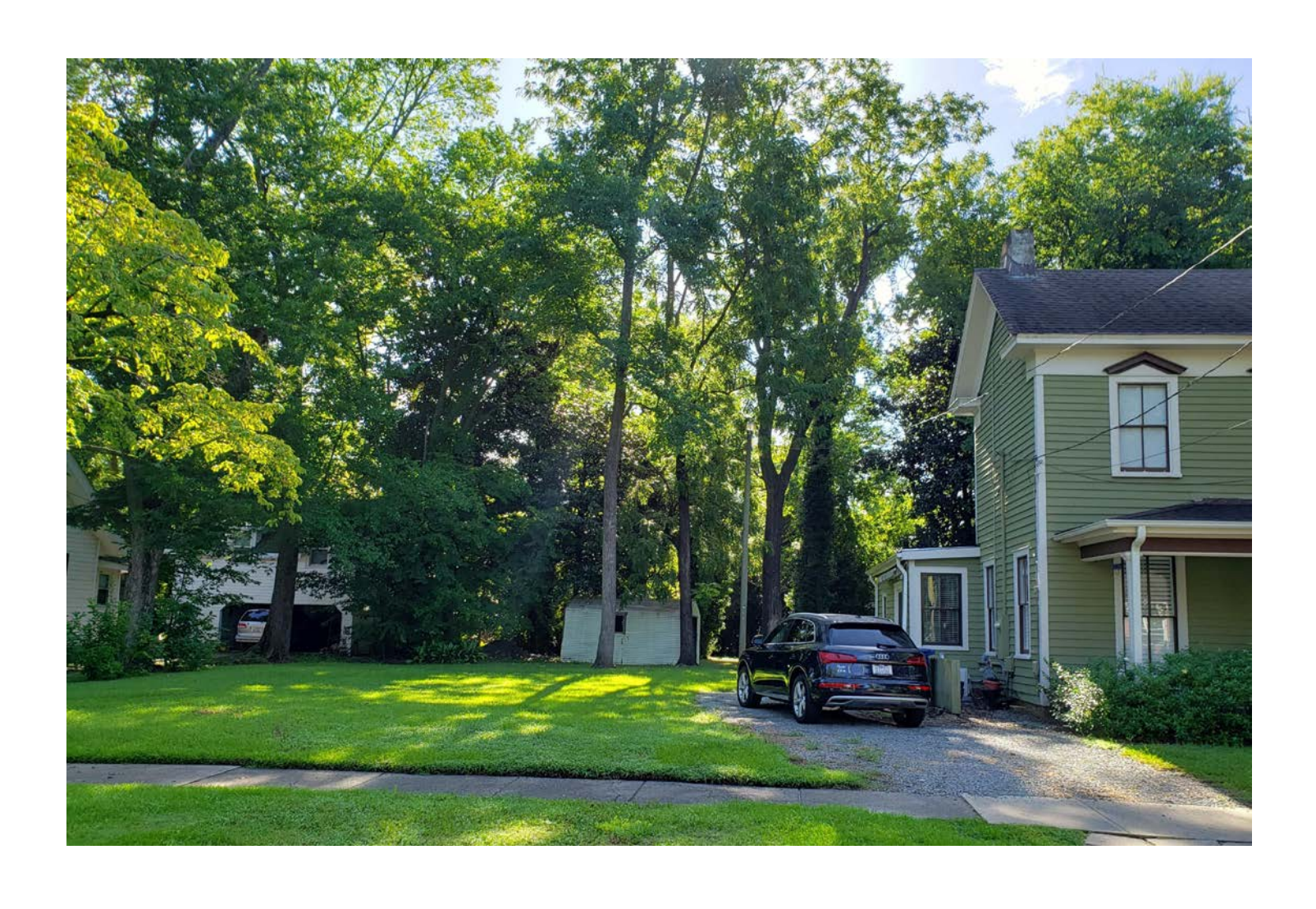
Side yard view from Elizabeth Street