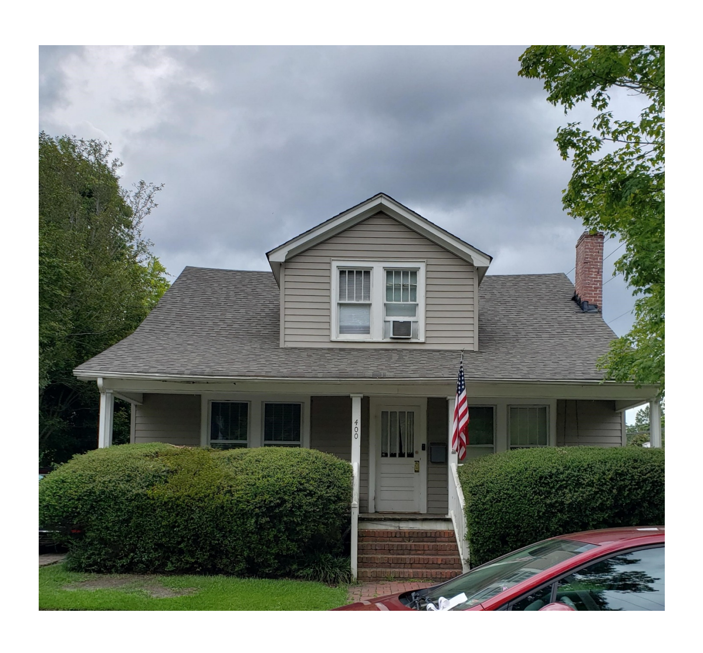
400 S. Eastern Street Replace roof with like color & shingles (after the fact)