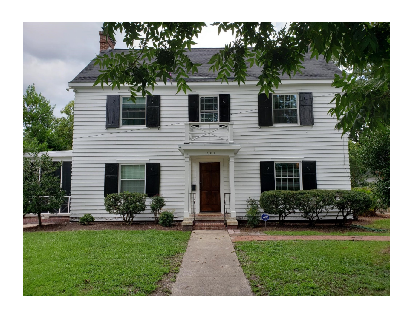
1301 Johnston Street Remove Storm Door