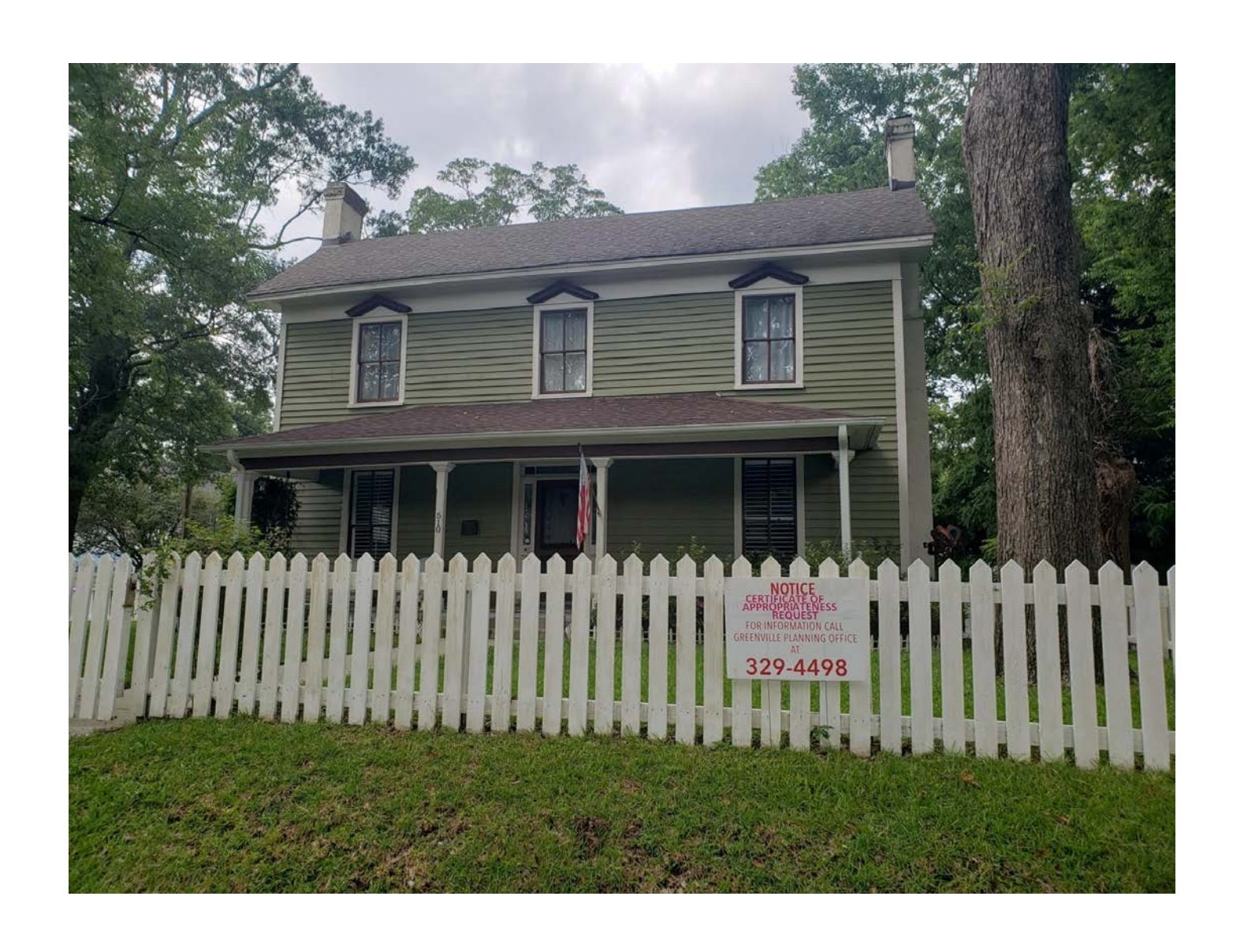
510 W. 4<sup>th</sup> Street