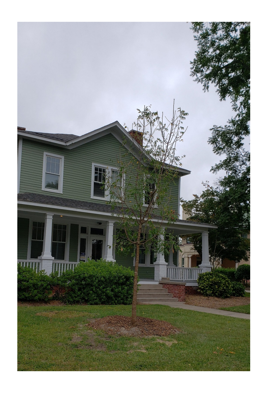
601 E. Fifth Street Remove severely damaged tree, replace with comparable tree