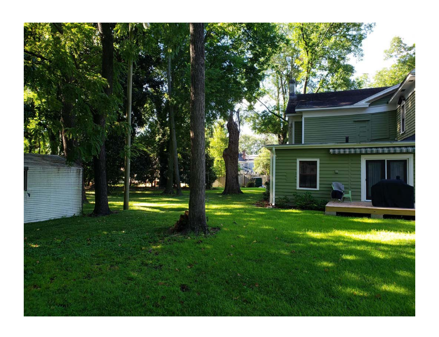
Backyard looking toward 4<sup>th</sup> Street