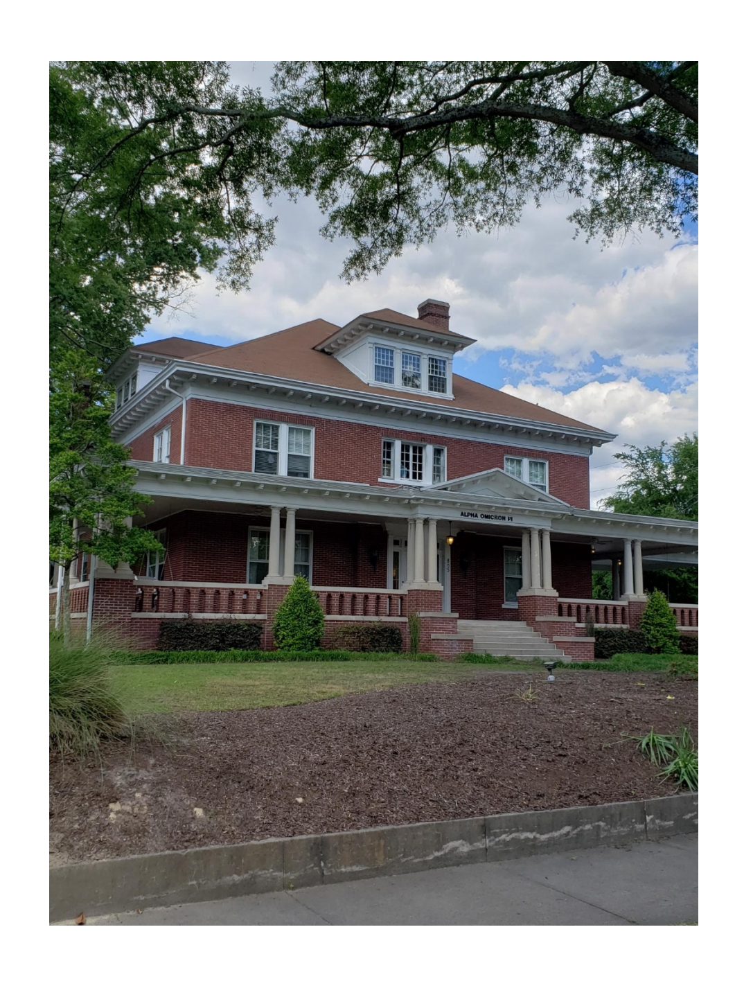
805 Johnston Street Internal gutter system repair, wood rot repaired and painted with like color