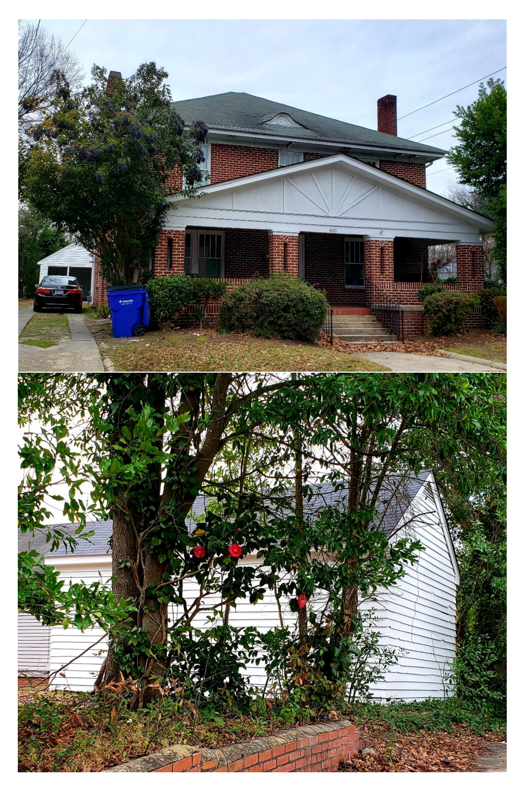
2021-40 – 400 S. Summit Street

Garage – Paint with like color, replace roof with like color and shingles -