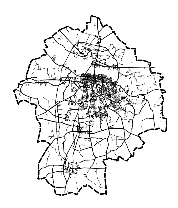
GREENVILLE URBAN AREA METROPOLITAN PLANNING ORGANIZATION

Prepared by: Greenville Public Works Department City of Greenville