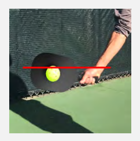
Figure 4-2 (illegal serve)