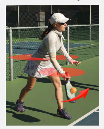
Figure 4-3 (legal serve)

(Photos and graphics courtesy of Steve Taylor, Digital Spatula)