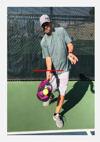
Figure 4-1 (legal serve)