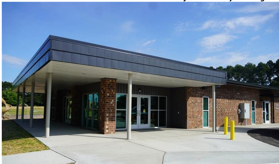
Renovated Front Entrance to Barnes-Ebron-Taft Community Building

Please let me know if there are any questions.