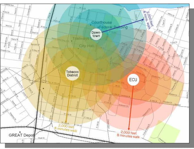
The ideal site would be close to Downtown, ECU and the Tobacco District. It would also be good to have a site on a railroad line, to allow for future passenger trains, but this may conflict with the other requirements.

It will probably not be possible to find a site that is ideal on each of the criteria. Stakeholders will need to decide which of the possible sites will be the best overall. In particular, the best site for bus riders (which will likely mean being as close as possible to downtown and ECU) may not be alongside a railroad line. Allowing for a future rail station on site is less important than finding the best site for existing bus services and riders. This is because the bus services are definite and will be the center's core role. Any future train service would probably only run once or twice a day. If necessary, a dedicated shuttle could run between the Center and the station to connect with train arrivals and departures.